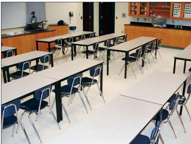
Table frame is 1-1/4" 16 gauge square tubing fully welded. Upper legs are 1-1/2", 14 gauge steel tubing and are welded to the table frame. Lower telescoping legs are 1-1/4" 16 gauge steel equipped with a locking set screw mechanism and height adjustable on 2" increments. Legs have adjustable screw in floor glides. The table adjusts from a minimum of 20" in height to a maximum 36" height.