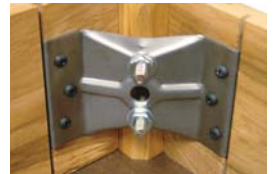
Table frame are constructed of 3/4" hardwood, bolted to 2 1/4" x 2 1/4" hardwood legs. Legs equipped with adjustable screw type glides. All hardwood is sealed, stained and lacquer finished with a medium oak stain (as shown). All edges are rounded for smooth appearance. Tables are available with or without storage compartments. Tables can be customized to meet your specific size requirements.