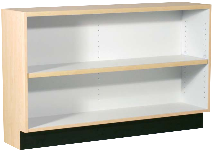
810 Series Laminated Bookcases