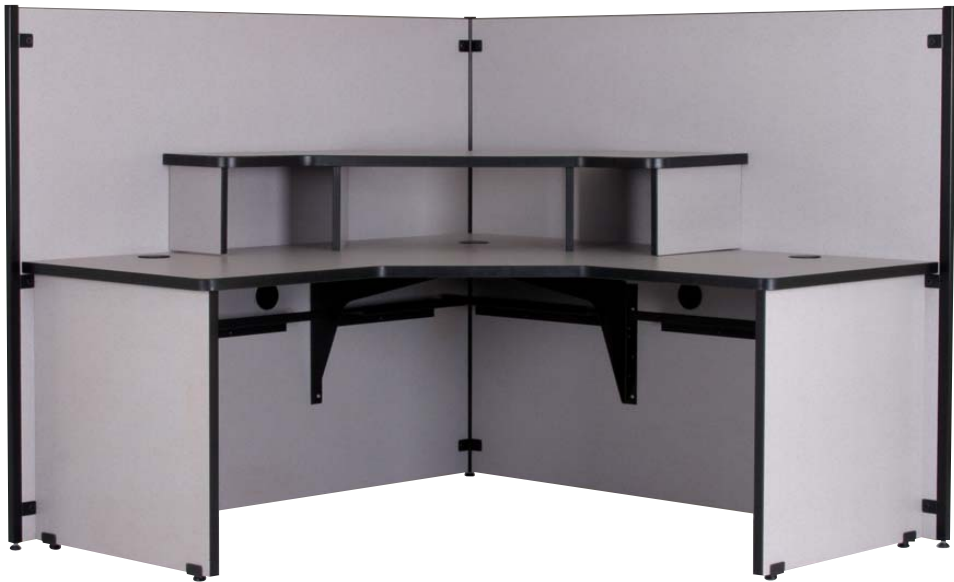
Steel Frame Technology Workstation